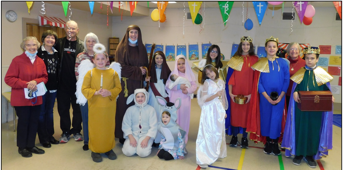
Christmas Pageant 2021 cast and crew