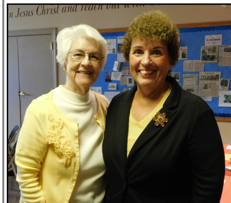
Isn't it lovely to have Church family!