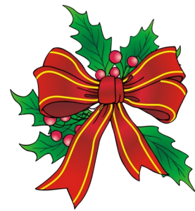
Christmas Pageant