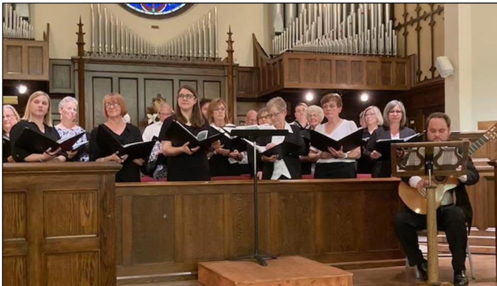
A Choired Taste Performing in 2025.

We hope this event will draw a large audience including some new faces and, of course, a great turnout from our congregation. Our goal is to demonstrate to the community that First Presbyterian is a welcoming place. You can help support our goal and our Church's mission by attending and inviting your friends to the concert. If you see someone you don't know that evening, please introduce yourself!