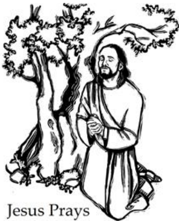
Jesus Prays for his disciples.